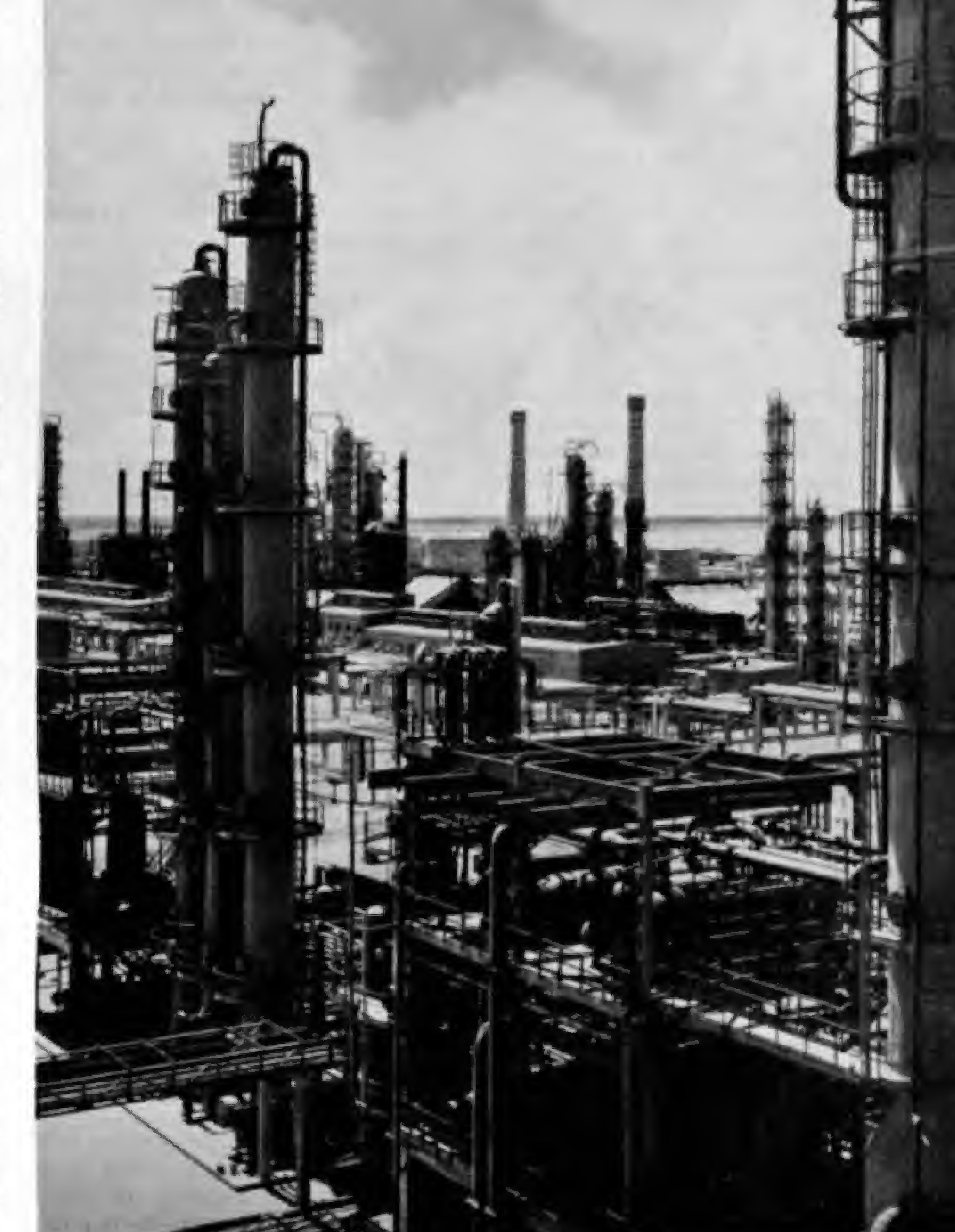
The first China-built platforming plant for the oil industry. Since it went into operation, it has reached advanced world standards on some points of performance, and surpassed them on others.

More than 1,000 new products were developed in 1966. They include a thread grinding machine of the highest accuracy, a medium